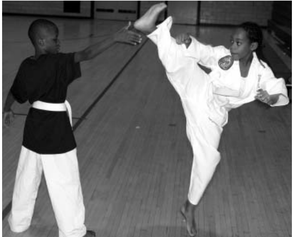
The Harlem Children’s Zone is dedicated to improving the lives of kids up to age 18 in central Harlem. Specifically HCZ seeks to put Harlem youths on an educational par with their middle-class peers.

At the same time, Canada and his management team reit-