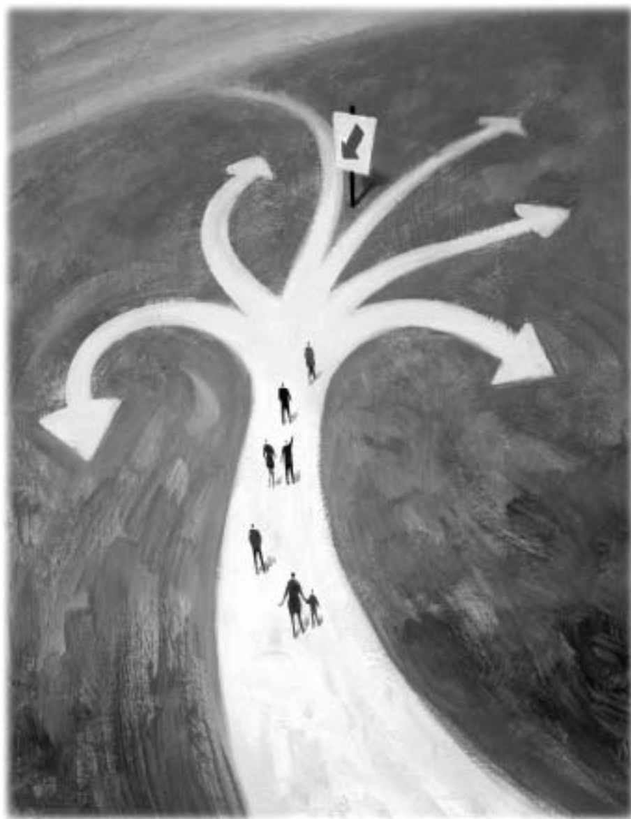
ILLUSTRATION BY ANDREW JUDD/MASTERFILE

Heroic efforts might help a handful of children escape from devastated neighborhoods like those of central Harlem. But saving the next generation would require a critical mass of adults versed in the techniques of effective parenting and engaged in common activities.