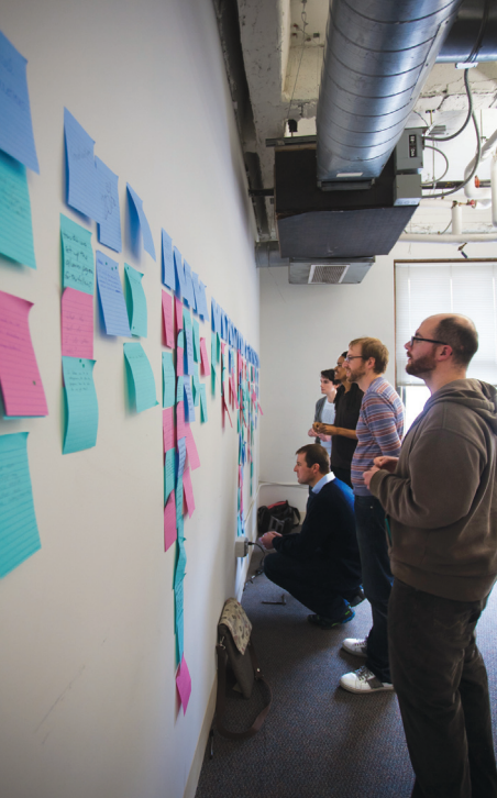
Code for America's first group of "fellows" will spend the next year helping four U.S. cities create innovative software.

Omidyar, and Rockefeller foundations had contributed $1 million. A number of corporate sponsors are also lending support, and high-profile endorsements have come from Facebook CEO Mark Zuckerberg, Twitter co-founder Biz Stone, and other tech leaders.