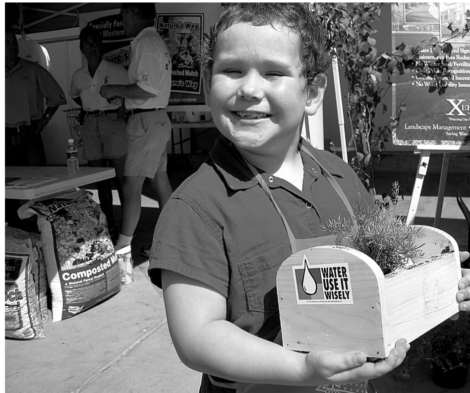
Home Depot’s Arizona stores offered weekend workshops on water conservation basics, including drought-resistant gardening. More than 3,100 consumers attended.