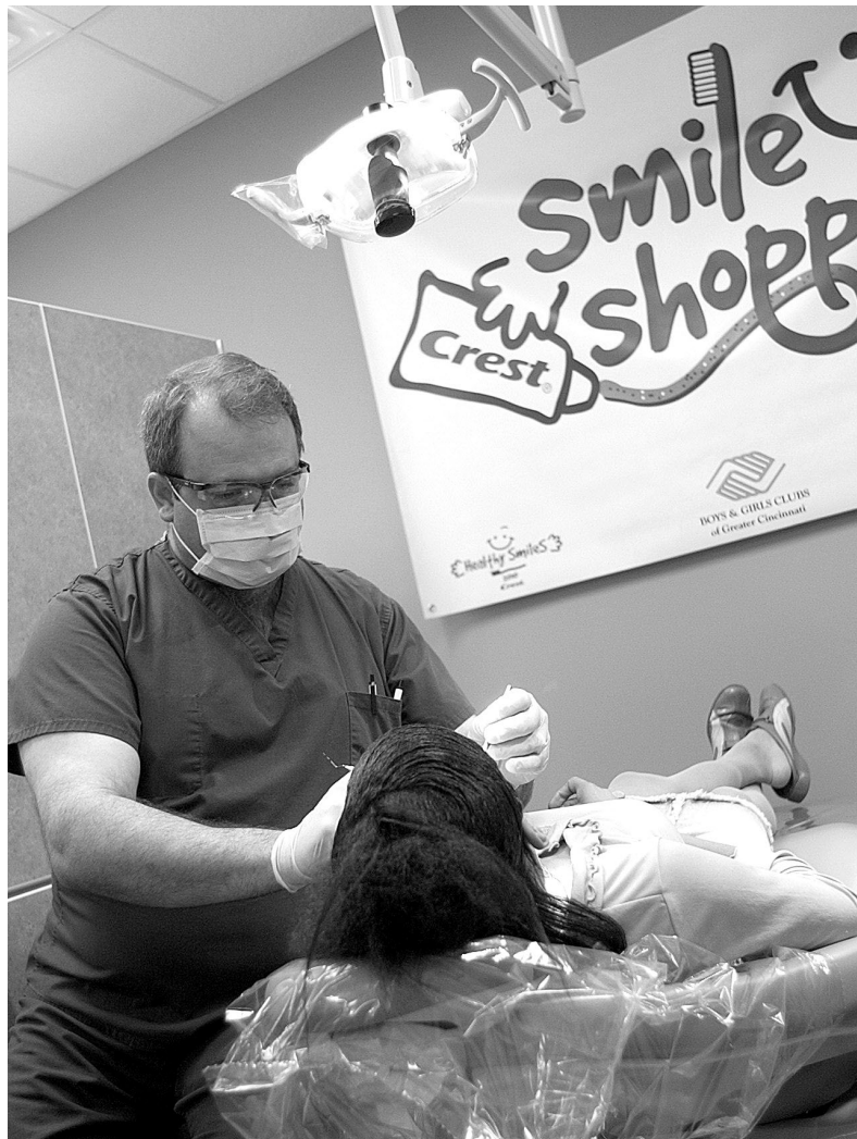
Crest has funded the construction of dental clinics in Boys & Girls Clubs in five states, providing affordable oral care to poor kids and their families.

And when today's Boys & Girls Clubs kids are asking their parents to buy products, or reach an age where they're buying