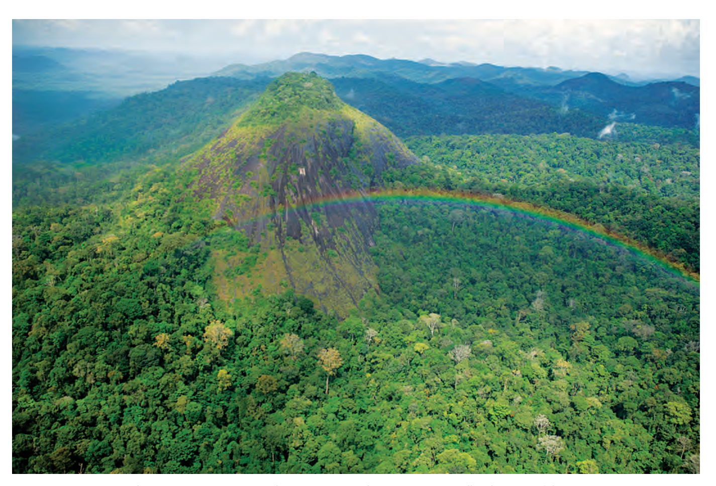
The Amazon Region Protected Areas project seeks to preserve 60 million hectares of the Amazon Rainforest, an area almost twice the size of the entire US National Park System.

agency—to secure them permanently. Although revenues generated by businesses operating within a protected area can assist (such as logging in British Columbia), experience suggests that governmental and philanthropic financial support will usually dominate. The transaction costs of the PFP project itself must be included, too among them the execution costs for NGO partners, fundraisers, and lawyers during the deal process, and for the technical support and advocacy needed in the years immediately after the closing.