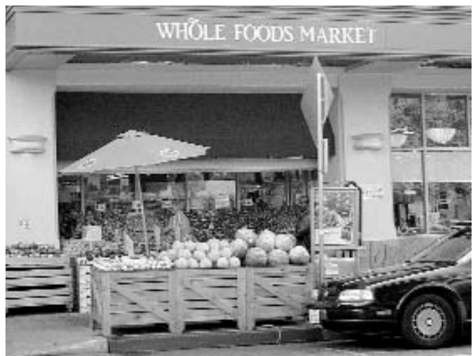
The Noyes Foundation invests in companies like Whole Foods, the world’s largest retailer of natural and organic foods, along with other firms that are committed to the environment.

Most of the program-related investments are in the form of low-interest loans to nonprofits. To take just one recent example, in 2000, Heron approved a five-year, $250,000 loan to the Greyston Foundation, a system of nonprofit and for-profit organizations in Yonkers, N.Y., that offers a wide array of programs and services for individuals seeking self-sufficiency. Greyston Bakery, the sole supplier of fudge brownies for Ben & Jerry’s ice