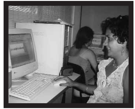
Telecenters operated by CEMINA, a Brazilian organization originally aimed at empowering women, give both men and women a voice in cyberspace.

One of the telecenters, the Telecenter Novo Ar, is in São Conçalo, in the state of Rio de Janeiro. Its 1,600 members each contribute a sum equal to 1 percent of the local minimum wage to fund the center. In turn, the radio station gives the center’s members access to the Internet, as well as to professional services in finance, healthcare, education, and other fields. Three days a week, the telecenter opens to the public, charging more than 700 registered users roughly 30 cents per hour for Internet access. On three other days the center offers courses on computers and Internet usage that aim to support small-scale entrepreneurial ventures. □