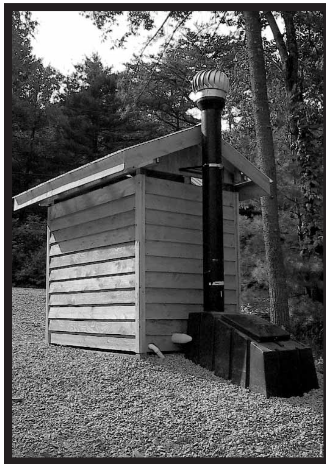
The Enviro Loo uses heat and air instead of water or chemicals to treat waste, and so does not threaten drinking water. The toilet also does not use electricity.