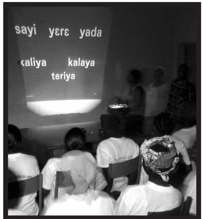
Women in Bamako, Mali, learn to read at night by using the Kinkajou microfilm projector.

Design That Matters organizes corporate volunteers and college students from the California Institute of Technology, Harvard, Stanford, and MIT into project teams that tackle specific issues in underserved communities. Other teams are currently tackling water cleanliness, renewable energy, and health-care. The funding comes from a mix of sources, including donations and private foundations, patent revenue, development agencies, and corporate sponsors.