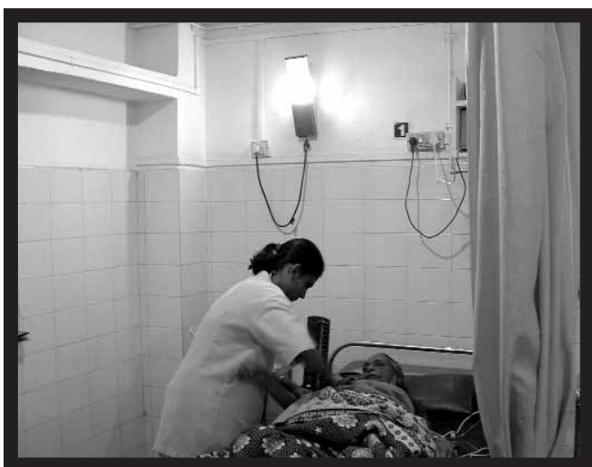
In rural India, SELCO's affordable solar power systems light up the night at (top) a silkworm farming enterprise and (bottom) a local hospital.

power plants, substations, and electric wires. As the cost of photovoltaic technology has fallen, it has become increasingly economical for residents of unwired locations to generate their own electricity using the power of the sun. Yet the poorest households, which could benefit from solar power the most, still have to borrow money to buy a system.