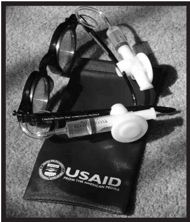
Getting custom eyeglasses without an optometrist is now a fluid process – wearers simply adjust the amount of liquid between the flexible Mylar lenses of these Adspecs.

sist of thin Mylar membranes with colorless silicone between them. While reading an eye chart, the wearer uses adjusters on the frames to pump fluid into or out of a lens to change its shape. A thicker lens magnifies better, compensating for nearsightedness, while a thinner lens helps farsighted users. After both eyes are correctly focused, the wearer snaps off the adjusters to seal the holes and maintain the correct focus.