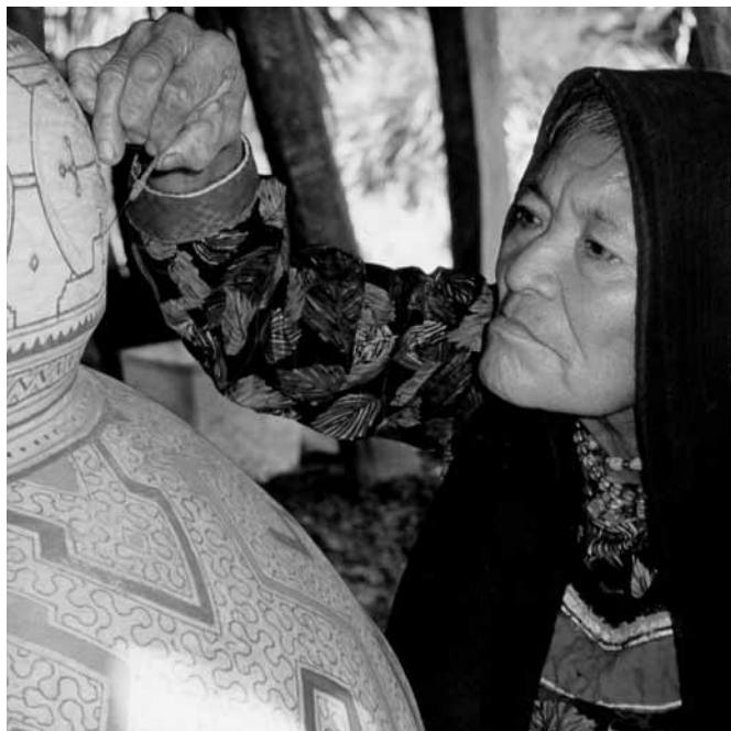
To meet demand for their unique pottery, Shipibo-Conibo villagers created four small businesses.

tices. To fill the order, American Trading would have to organize potters, train artisans in mass production techniques, institute quality control methods, and clear other business hurdles. Although the company had money to invest in building capacity among the villagers, it was afraid that it would never turn a profit if it had to pay the full cost. The barriers were so great that the company was actually considering turning Pier 1 down, despite all the work it had put into obtaining the order.