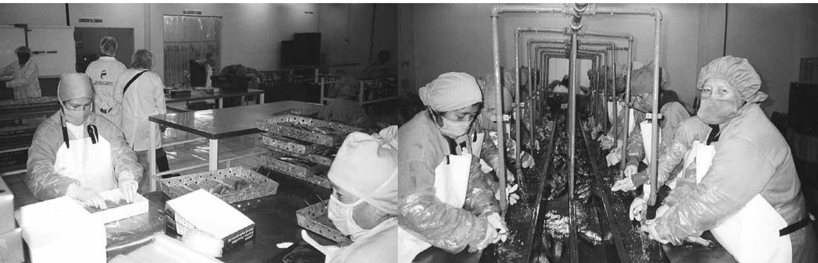
Workers at the Piscifactoría de los Andes plant process trout in Huancayo, Peru. Piscifactoría and a neighboring trout farm, the SAIS, overcame their mutual distrust and are now business partners. Trust is lacking in much of the developing world.

By the time PRA came along in 2001, the SAIS was bankrupt and profoundly suspicious of overtures from outsiders, and