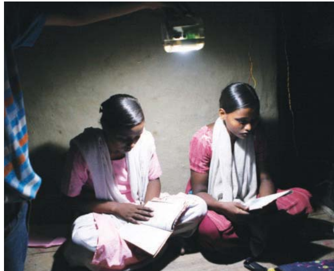
Two women in Uttar Pradesh, India, can now study at night because of their safe and affordable D.light lamp.