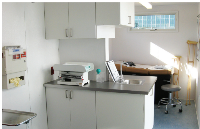
Used shipping containers are converted into health care clinics that can be easily transported to the developing world.

pleted and the design gets fine-tuned, C2C could expand rapidly. Surplus shipping containers are already scattered around the globe. “With the downturn in trade, they have become an eyesore,” Sheehan says. She envisions developing a C2C kit so that these abandoned containers can be retrofitted on-site in developing countries. The kits will create economies of scale, bringing down the cost.