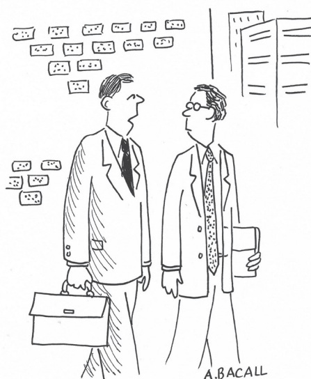
"Did you notice how he was suddenly interested in our sales pitch when I mentioned a substantial bribe?"