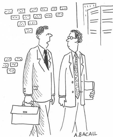
"Did you notice how he was suddenly interested in our sales pitch when I mentioned a substantial bribe?"