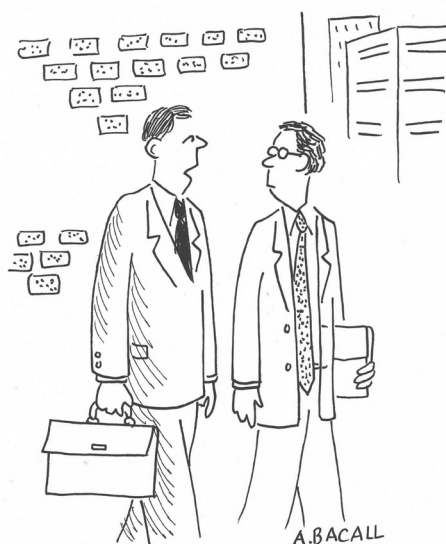
"Did you notice how he was suddenly interested in our sales pitch when I mentioned a substantial bribe?"