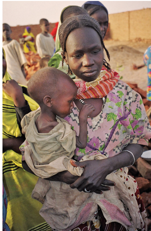
A mother holds her malnourished child at a camp for internally displaced persons in Kebkabiya, North Darfur.