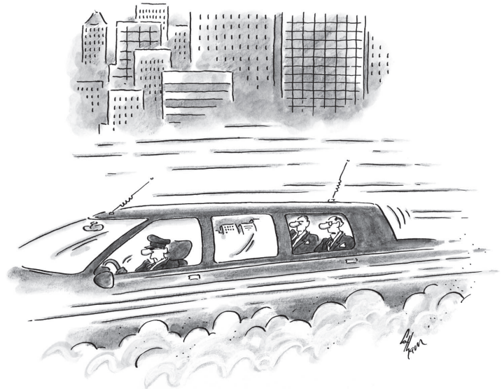
“I contributed a lot to charity when I thought I was going to die.”