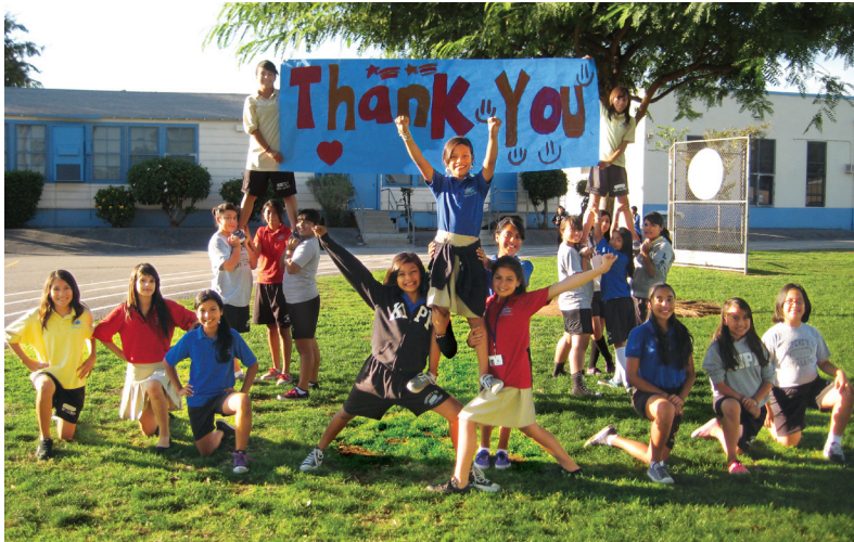
A cheerleading squad from a Los Angeles middle school received a portable boombox through DonorsChoose.org.

One of the good things about private foundations is that they don’t have to go through official