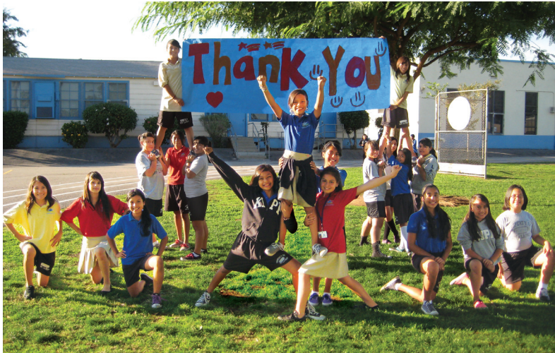
A cheerleading squad from a Los Angeles middle school received a portable boombox through DonorsChoose.org.