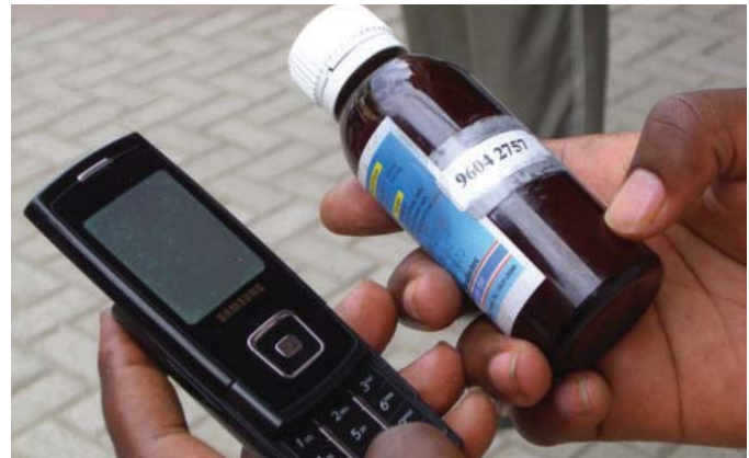
Ghanaians can easily find out if the drug they bought is legitimate by texting a scratch-off code and receiving instant authentication.

Here’s how the drug authentication system works: At the point of sale, a buyer scratches off a label to reveal a unique numeric code. Using text messaging, the buyer sends this code to an automated hotline, which checks a database and reports back immediately whether the