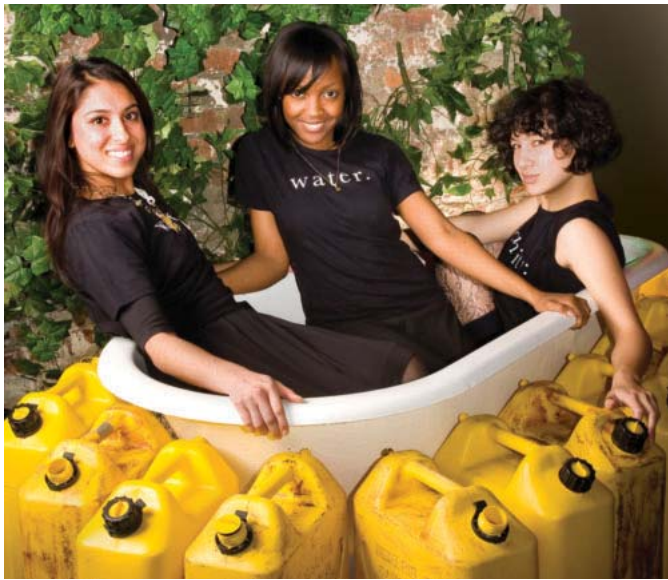
Fashionable Twitterers combine clubbing with fundraising for clean drinking water at New York's M2 Ultra Lounge.